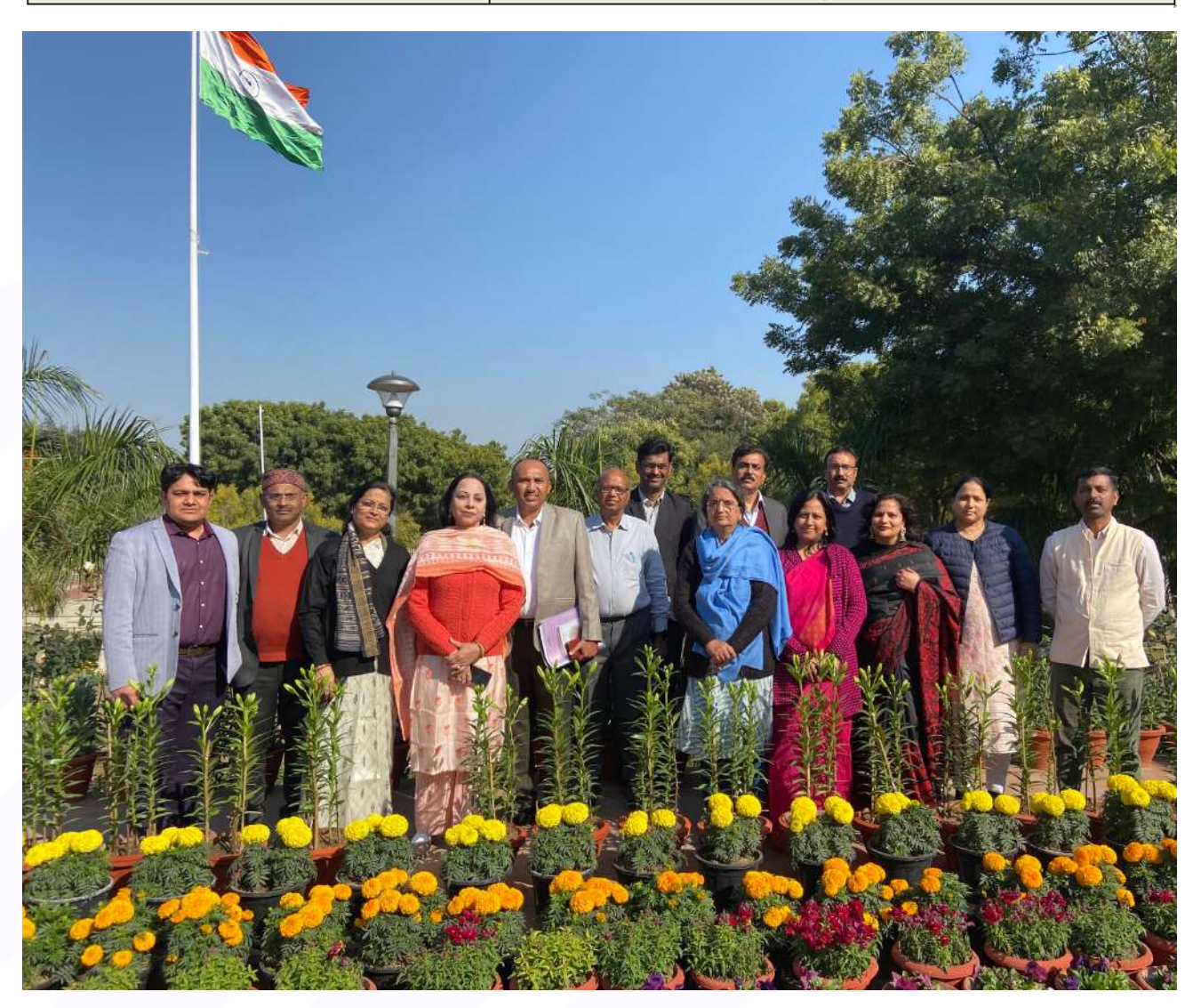
Dr BRAOU Participants and CIQA, IGNOU Resource Persons